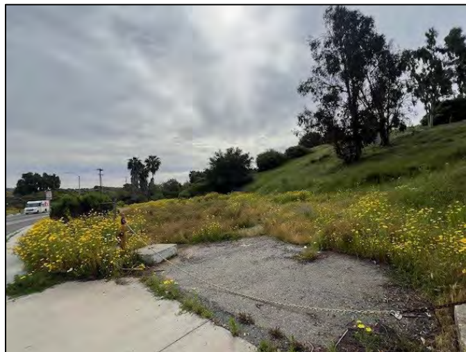
Plate 1. Overview of project area, view east.

HELIX archaeologist Michael Tapia and Native American Monitor Logovi'i Saolo'i from Saving Sacred Sites surveyed the project site on April 19, 2024. The project area was surveyed in parallel transects spaced 5 to 10 meters apart. Ground visibility was very poor, with dense vegetation covering the soil (Plates 1-3). Vegetation included dense grasses, cacti, palm trees, eucalyptus, castor bean plants, vines, and mustard plants. A dirt trail along the western perimeter allowed for moderate ground visibility. The northeastern corner of the property was not surveyed due to safety concerns from an unleashed dog and a homeless encampment.