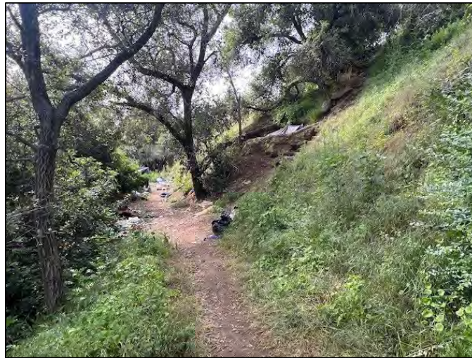
Plate 3. Overview of dirt trail noted within the project area, view to the east.

No previously unidentified cultural resources were observed, nor were any resources associated with site P-37-000641 observed.