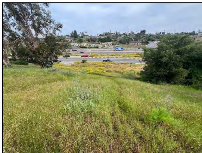
Plate 2. Overview of project area, view north.